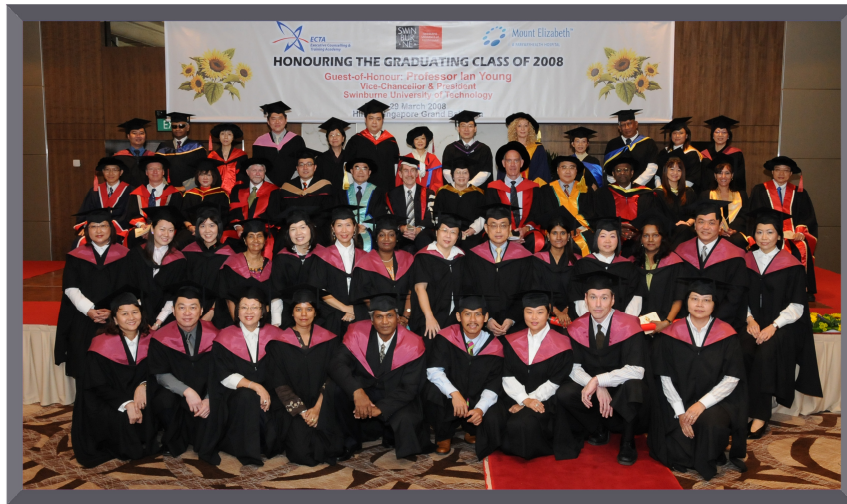
MASTER OF SOCIAL SCIENCE IN PROFESSIONAL COUNSELLING (2 nd & 3 rd INTAKES)